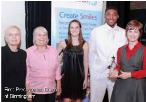
First Presbyterian Church of Birmingham