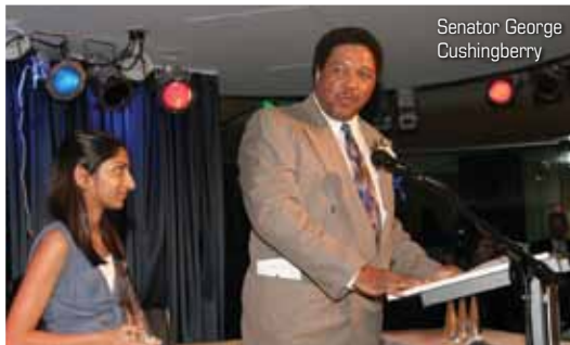
Senator George Cushingberry