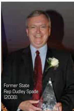
Former State Rep Dudley Spade (2008)