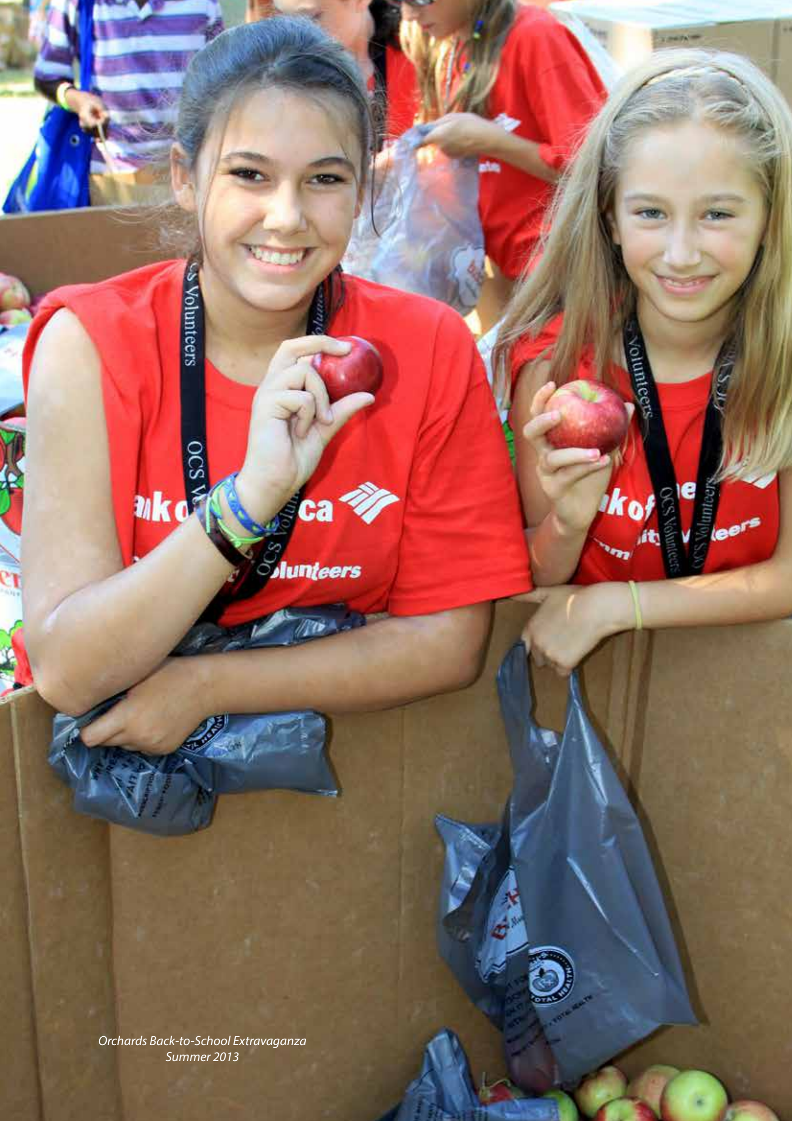
Orchards Back-to-School Extravaganza Summer 2013