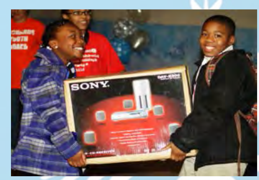
Above: The children are overjoyed with the gift the family won at the holiday party.

More than 700 people attended Orchards' annual holiday party, which was held at Forgotten Harvest. There was dancing, face painting, arts and crafts, cookie decorating, food, and plenty of giveaways. In addition to Ms. Claus and several elves, Rudolph also visited Santa in his own private candyland room! Thanks to Chrysler LLC, our presenting sponsor, and Forgotten Harvest for donating their facilities. A good time was indeed had by all.